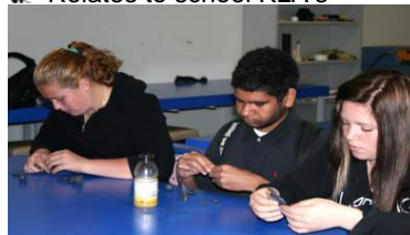
Industrial Design Workshop